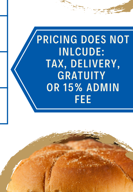
× × × × × × × × × × × × × × × × ×