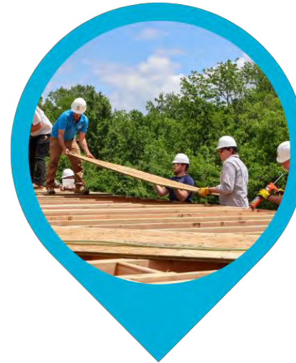
Pathway at Heritage Park Olathe